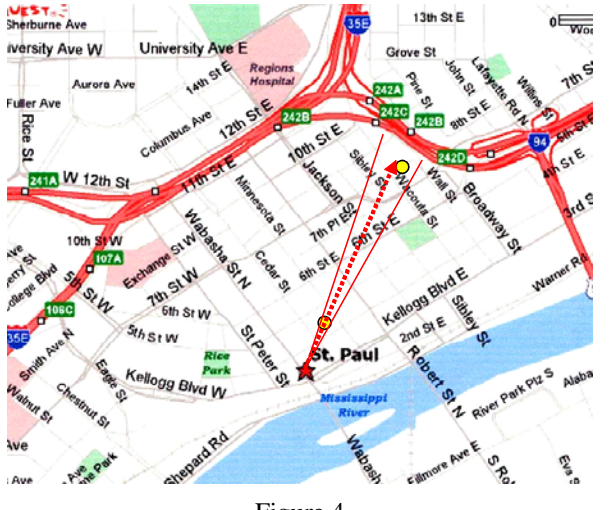
Figure 4 Asian Restaurants in That Direction