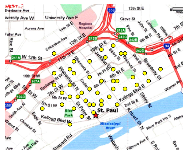
Figure 3 All Local Restaurants

In a more "Yellow Pages" kind of example, a customer can data mine via LBS in different ways. Figure 3 shows a typical downtown map showing locations of all restaurants in the general latitude and longitude of the customer. By enabling an electronic compass of adjustable precision, the customer may narrow the request by asking for "all Asian cuisine in this direction", and point the phone. Figure 4 shows the results of a compassaided search.